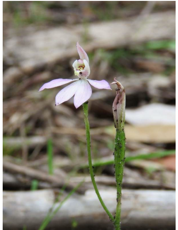
Pink Fingers ( Caladenia carnea )

The walking group returned to picnic area for lunch and awaited the Koala Count.