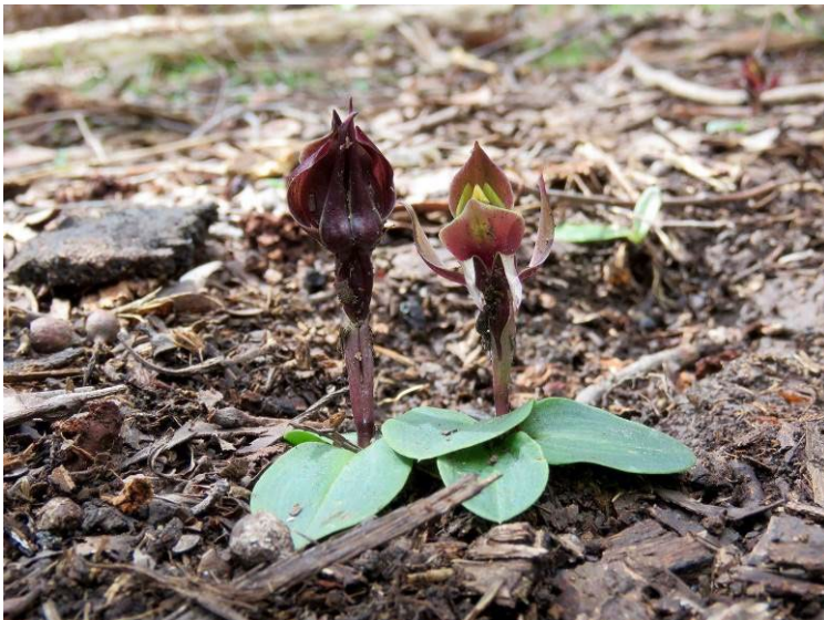
Common Bird Orchid ( Chiloglottis valid )

For the day there were two activities. Firstly, for the orchid walk the group travelled over to Stringybark Track. The family group could not maintain their enthusiasm so they at different stages turned around and returned to the picnic area. But the rest of group were hardier, and they completed the circuit. Below are some of the orchids Caitilin captured.