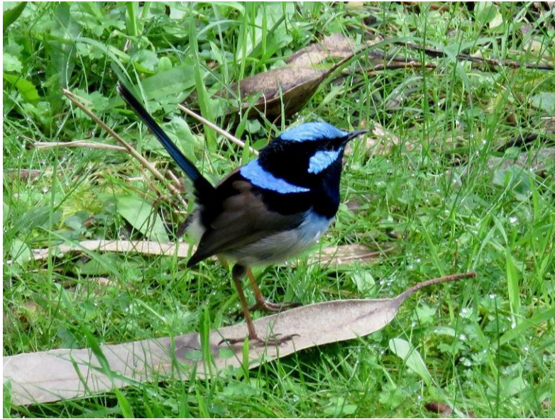
Male Superb Fairy-wren (Malurus cyaneus) in breeding plumage

While photographing the damp forests, Caitilin caught two koalas fighting.