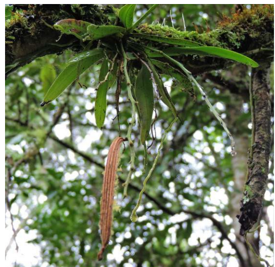
Butterfly or Gunn's Tree Orchid Sarcochilus Australis (Gunnii)