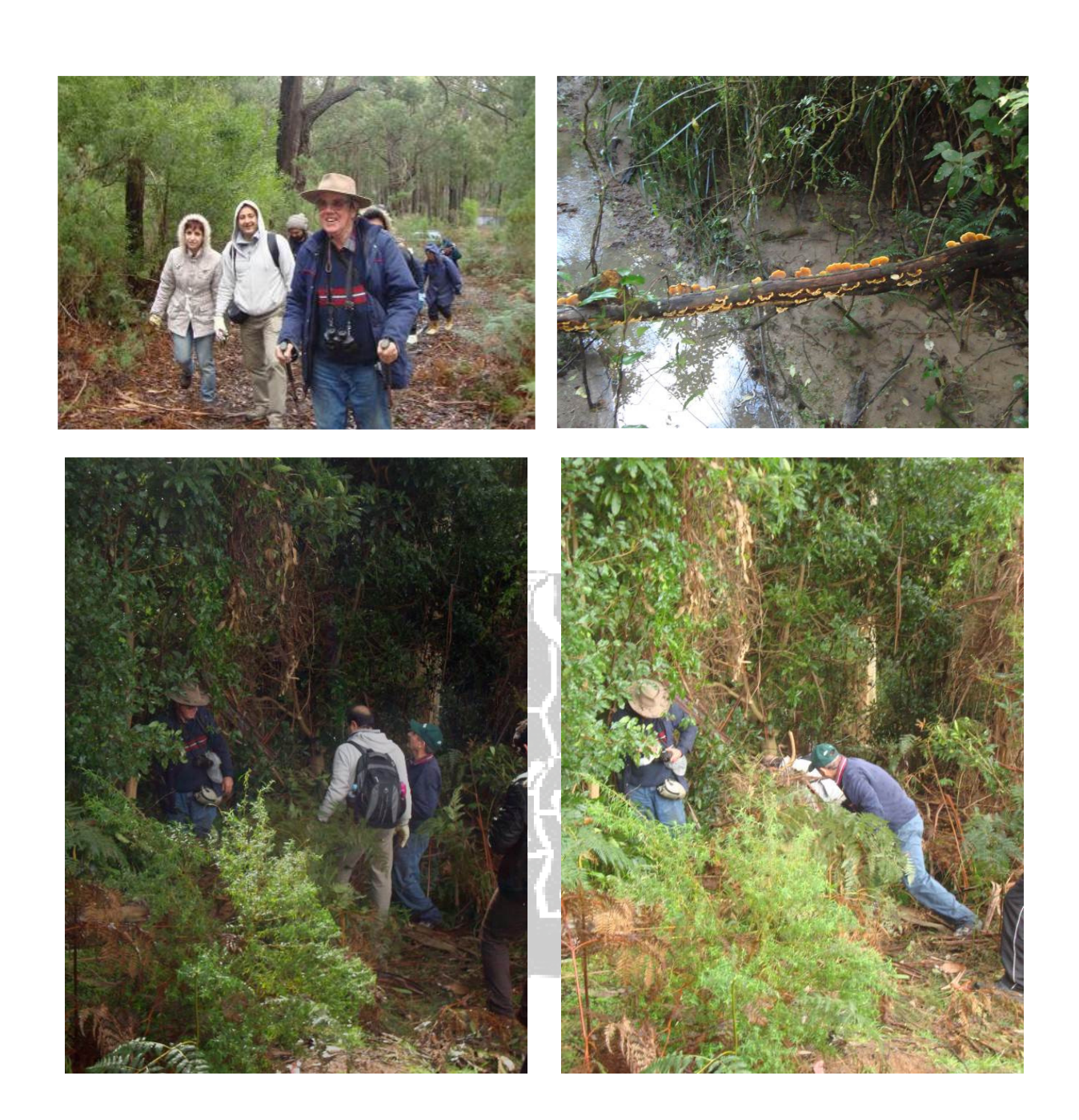
July Activity Sunday 15<sup>th</sup> July 10.00am

Note: this is a change from the original calendar