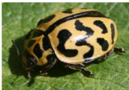
Above: Cleobora mellyi

Of course, AGM time means subscription renewal time, too, so please make use of the renewal form below if you need to. Here are some of Ken's photos of various critters we have found around the Park over the last few months.